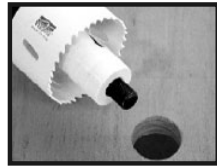
Smaller existing hole.