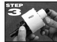
Select a hole saw to match the diameter of the existing hole. Screw the smaller diameter hole saw to the CoPilot ™ attachment.