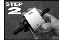
Remove existing pilot drill bit and insert CoPilot ™ into arbor and tighten arbor screw.