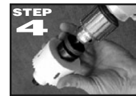
Insert into chuck. For your safety unplug or remove battery pack from drill while chucking the CoPilot ™ Hole Saw Assembly.