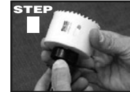
Attach your selected larger hole saw to arbor.